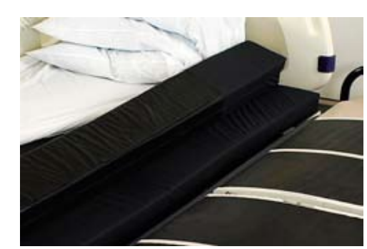
Hinged transfer pad allows full bed coverage and fits narrow stretchers.